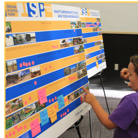
Top 10 Programming